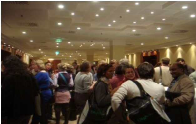
EMWA Conference Frankfurt Autumn 2009

present interactive exposure opportunities. The forthcoming events scheduled for spring 2010 in Lisbon and autumn 2010 in Nice both provide a medium for networking, active discussions and extensive cost-effective professional training amongst the community. The venues, facilities, and training programmes are chosen to offer you the best possible learning environment. In addition to the formal training sessions, a relaxed, friendly conference atmosphere provides an ideal networking opportunity and enables all those attending to interact with medical writers and communicators at all stages in their career.